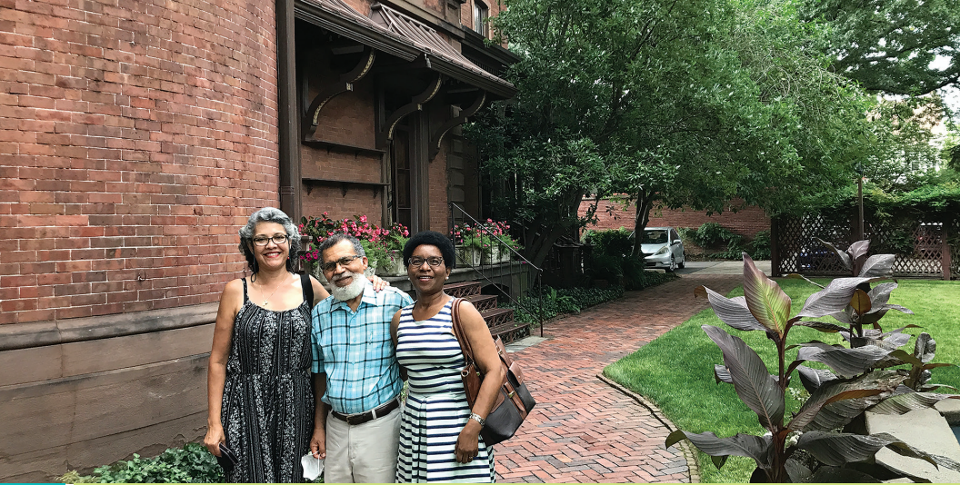
Lippitt House Museum's English Language Learner participants enjoy the garden.