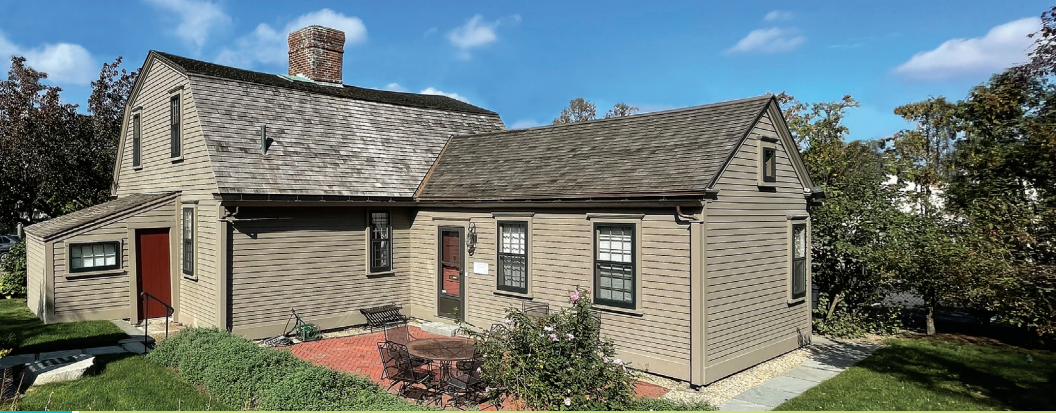
Providence's Jeremiah Dexter House (c 1754) is home to Preserve RI's headquarters.